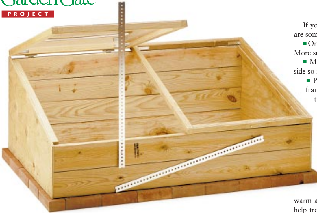
▲ This portable cold frame can be built in a day but should last forever. For best results, paint or stain the wood. See the plan on the next page.